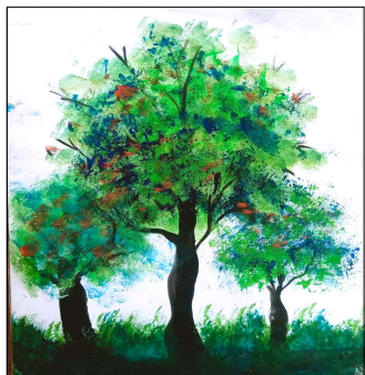
Divyansh - VI (A)