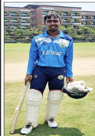
White XI (Railway Katihar won by 9 wickets)