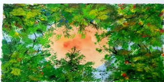
Padmaja Priya - VIII(B)