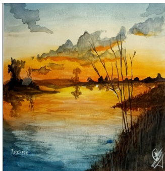
Taskheer Raza - VIII(A)